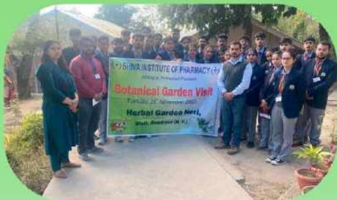
BOTANICAL GARDEN VISIT