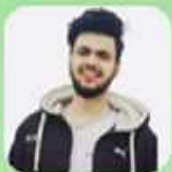
Mr. Prince East India Pharmaceuticals