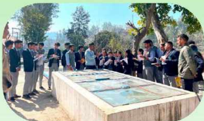
WATER TREATMENT PLANT VISIT