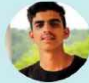
Sankalp Dr. Reddy's Laboratories