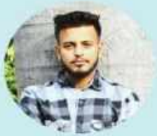
Akshay Abbot Health Care